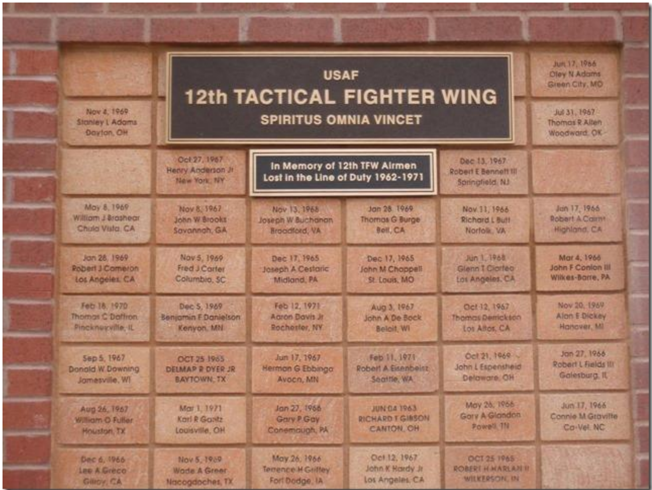
12 TFW wall panel with new and added plaque. (view is upper section of the panel)